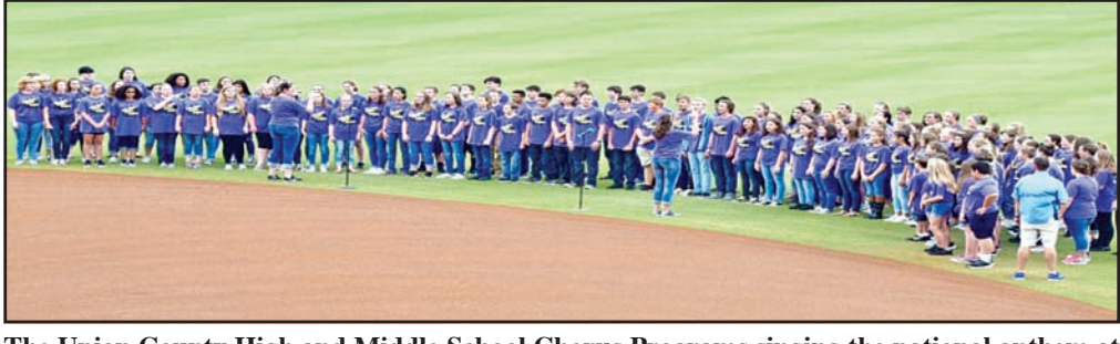
The Union County High and Middle School Chorus Programs singing the national anthem at Coolray Field in Lawrenceville before the Aug. 18 Gwinnett Stripers baseball game. See Chorus, Page 2A